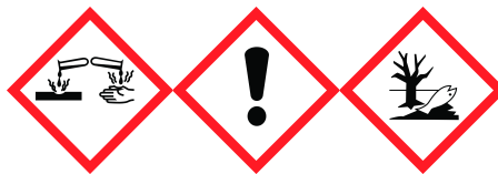
Corrosion Exclamation mark Environment